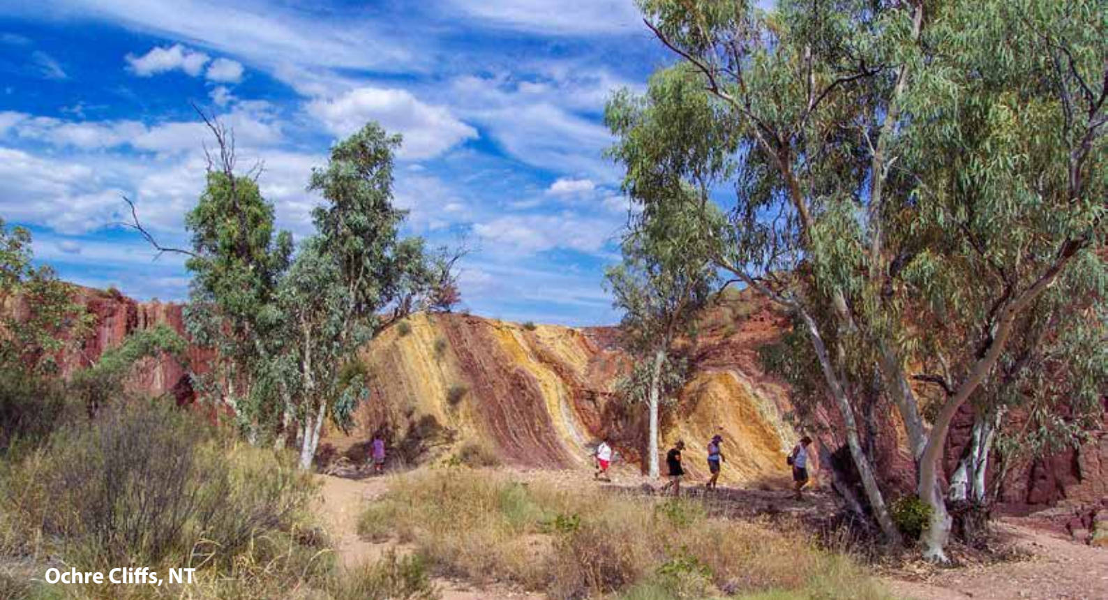
Ochre Cliffs, NT