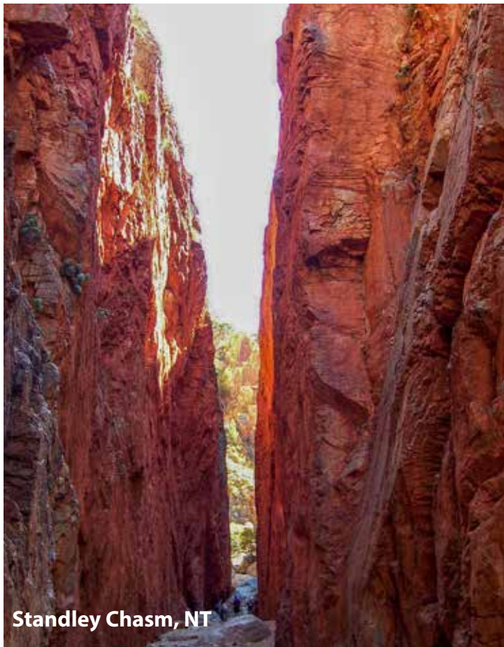
Standley Chasm, NT

50,000 slender stems crowned with radiant frosted glass spheres will gently bloom with rhythms of coloured light. Voyages Outback Pioneer Hotel, Yulara (PH: 02 8296 8010)