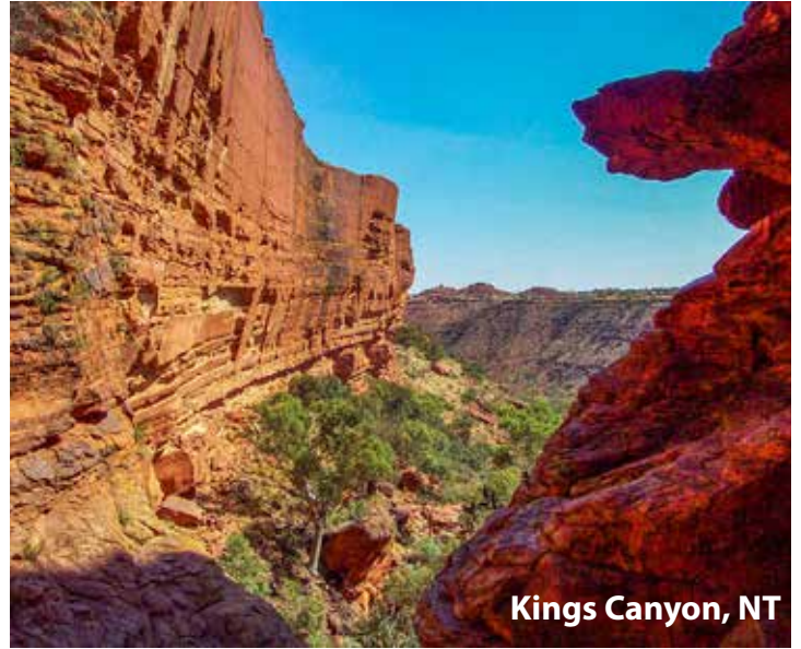
Kings Canyon, NT