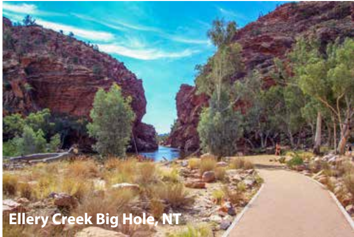
Ellery Creek Big Hole, NT

Crowne Plaza Alice Springs Lasseters (PH: 08 8950 7777)