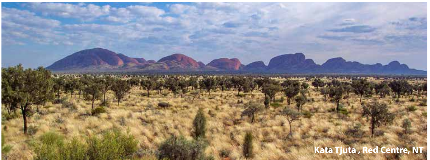
Kata Tjuta , Red Centre, NT

This tour can link with with Stonestreeets Taking Tracks and the Territory Explorer tours. For more Information call 1800 673 337