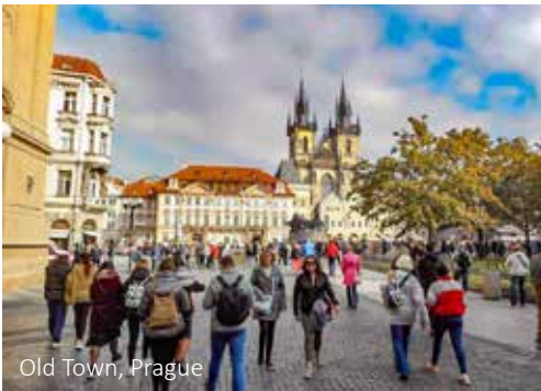
Old Town, Prague