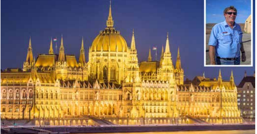
Parliament House Budapest