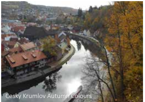
Cesky Krumlov Autumn Colours