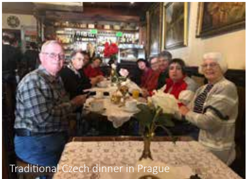
Traditional Czech dinner in Prague